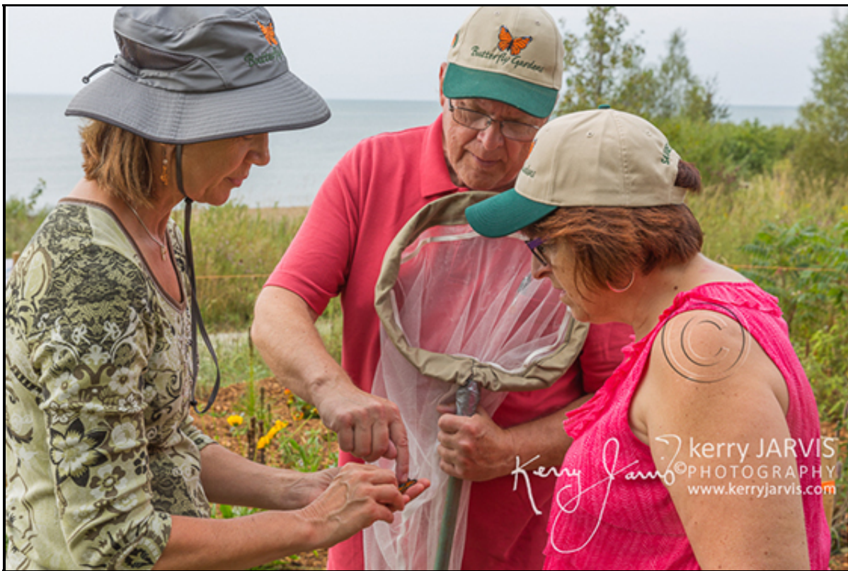
Butterfly Gardens of Saugeen Shores tagging Monarchs along Captain Spence Path in Southampton. Certificate from Monarch Watch of recovered tag.